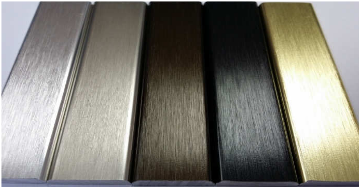
L-R: Silver, Duracolor Bronze No1, Duracolor Bronze No5, Duracolor Black and Gold 132.