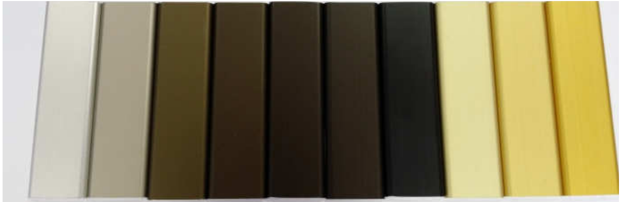
L-R: Silver AA05, Duracolor Bronze No1, Duracolor No3, Duracolor No5, Duracolor No7, Duracolor No9, Duracolor Black AA25, Gold 131, Gold 132 and Gold 133.